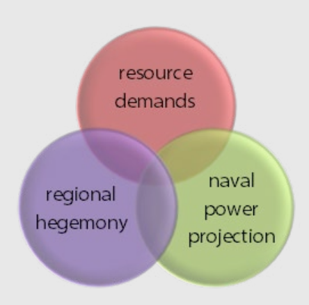
Figure 1: Strategic considerations behind China's maritime strategy. Authors' own depiction

In general, there are three different strategic objectives as regards China's maritime approach.